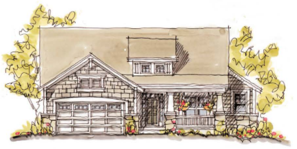
Fairfield - Craftsman Model